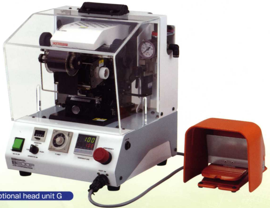
Photo: B200P with optional head unit G

Pneumatic controlled Legible markings are obtainable constantly Suitable for large volume markings