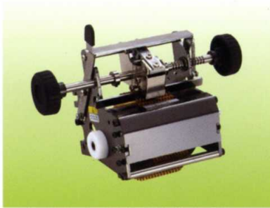
● Head unit G (character wheel system)

Different types of marking head unit options to accommodate various applications