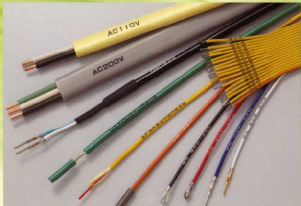
Electric wires Optic fibers