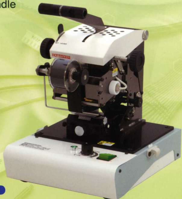
Photo: B200M with optional head unit G

Manually operated Easy operation – just press down the handle Suitable for small lot markings