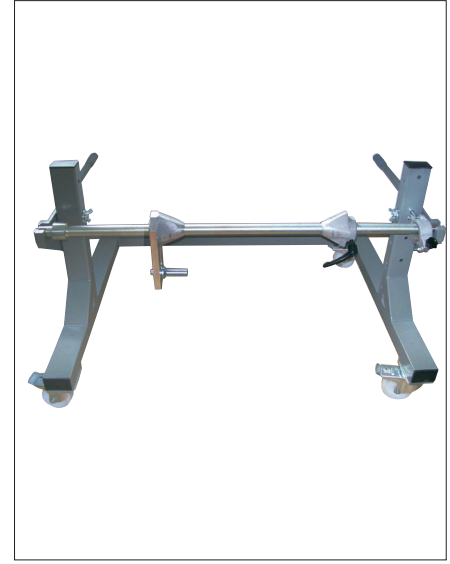
Fig. 3 TROMTRAK 1250