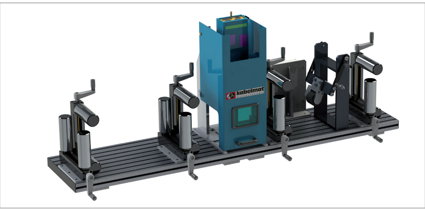
Fig. 1 MESSBOI LASER

Contactless length measuring device with roller guides working as per the laser-Doppler principle, certified as per MID 009. Specially developed device for installation in length measuring lines which require calibration.