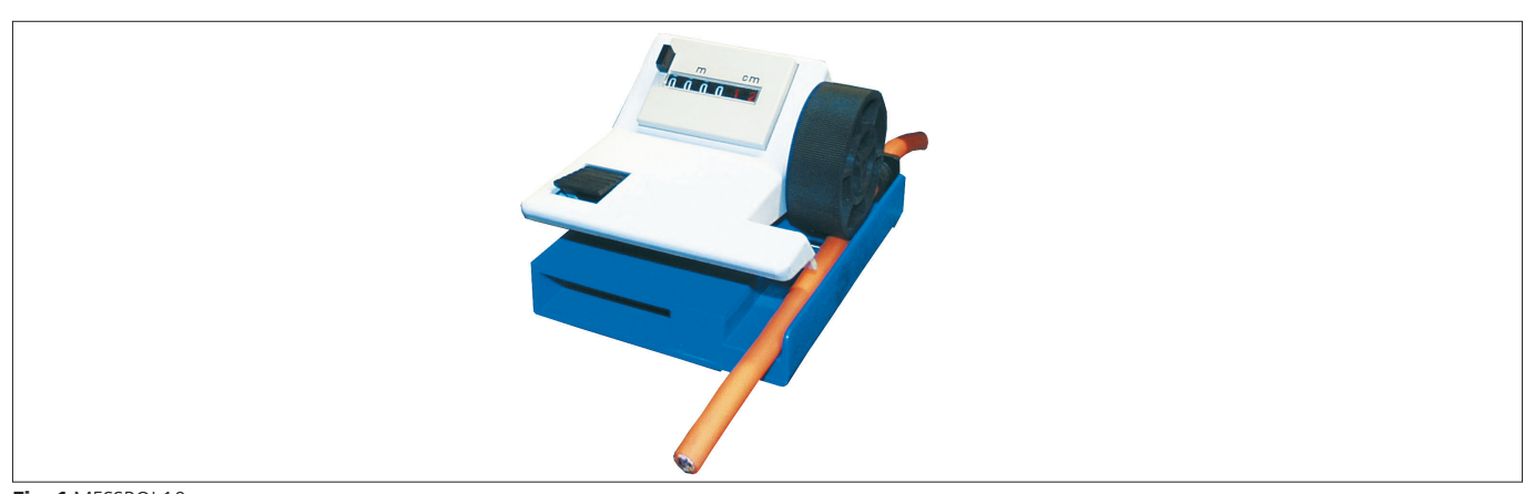
Fig. 1 MESSBOI 10